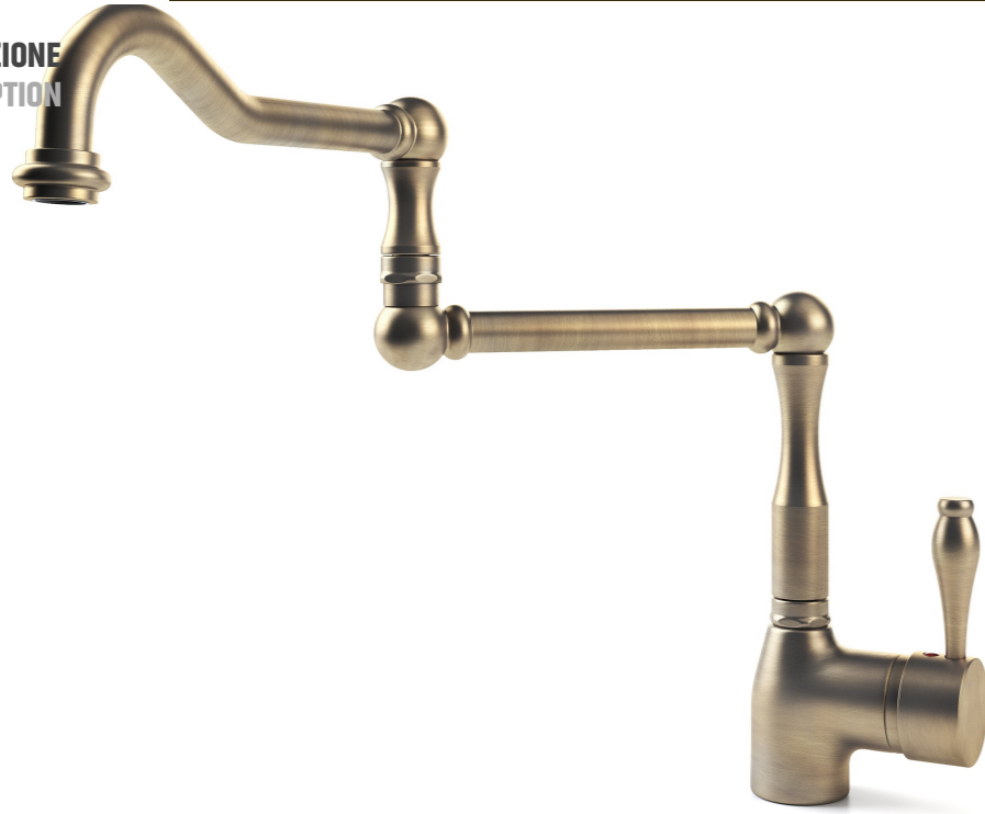
Rubinetto riempi-pentole DECK MOUNTED POT FILLER